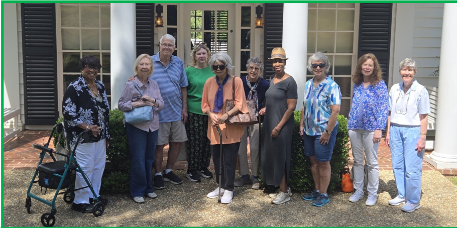
The Daytrippers enjoyed a visit to the Little White House in Warm Springs on May 19.

Graduate Recognition Sunday June 7 11:00 am Morning Worship